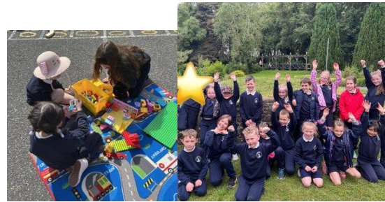
Lots of outdoor fun and learning in 1 st class this term