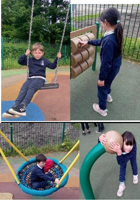
An super field trip to the Phoenix Park