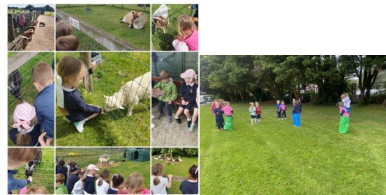
Here is a selection of great pictures from this term in Junior Infants including sports day, school tours, PE and releasing butterflies.