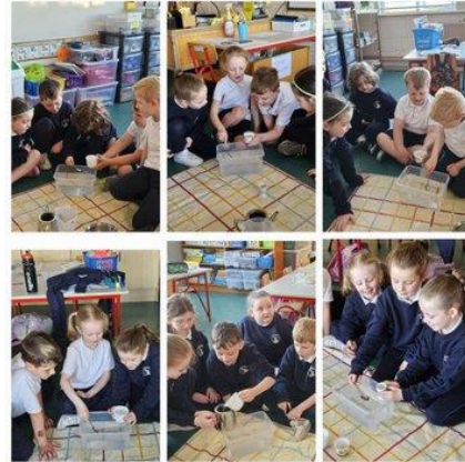
Good friends and good times!