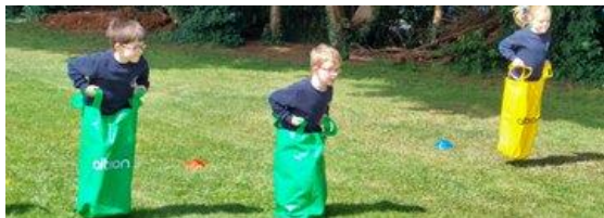
Sports day, fun day, school tour fun