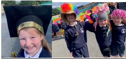
Crazy hat day

Finally a selection of fun photos from this term.