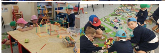
Great times in Senior Infants this term