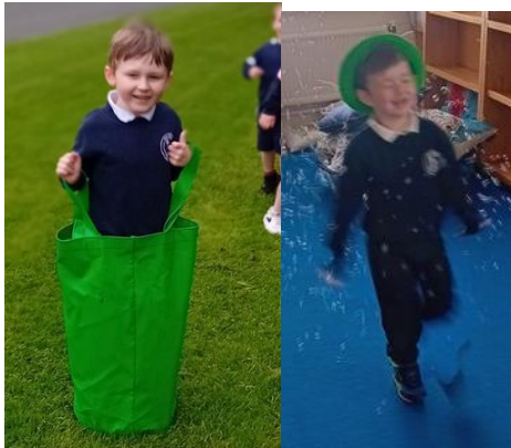
Sports day fun and classroom activities